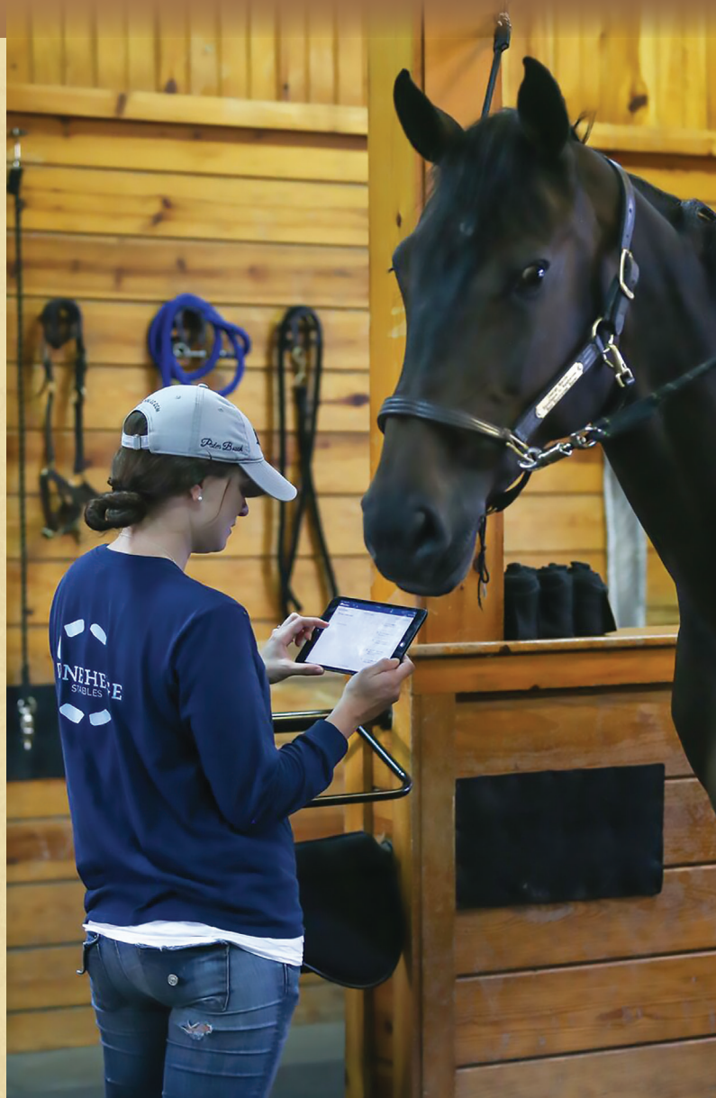
BarnManager is now used in barns throughout Wellington on phones, tablets and computers.

Lakin hopes to continue to change the way barns are managed in Wellington and nationwide for the ease of the job and to allow barn managers to get back to why they likely